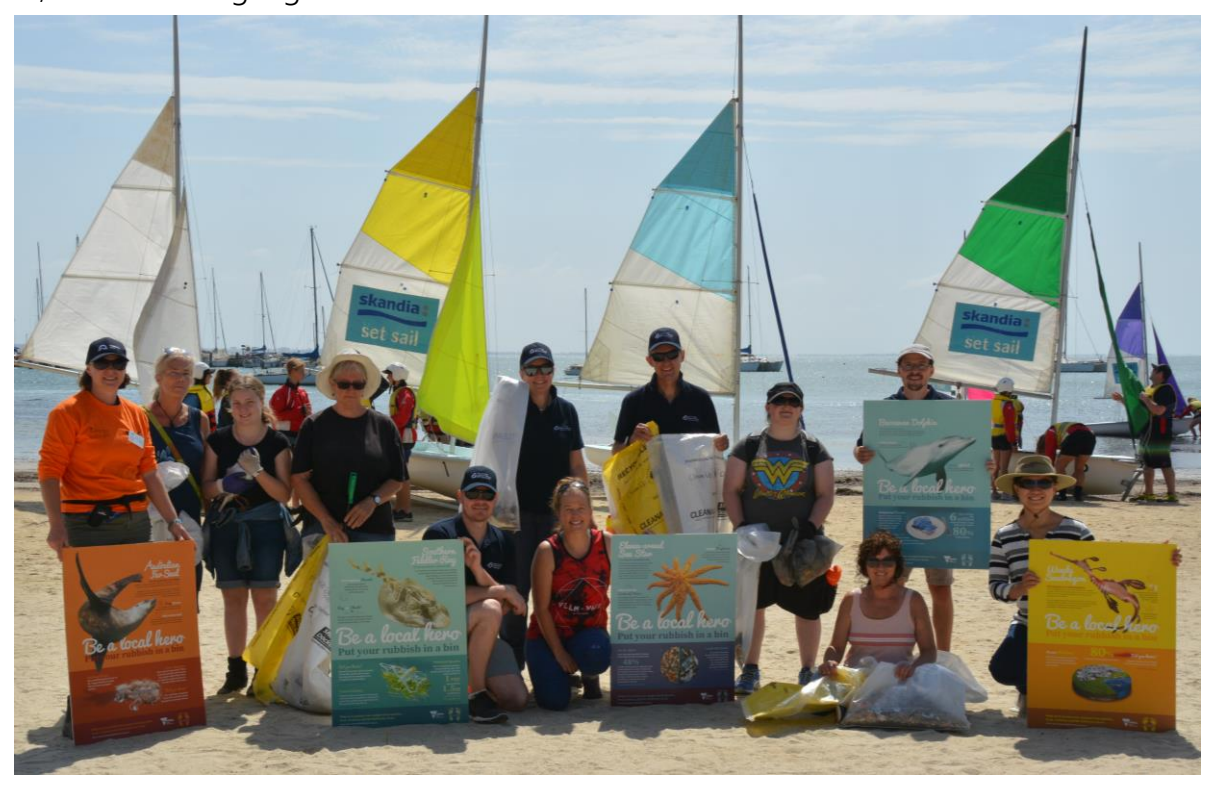
Business and Community Clean Up Australia Day at Eastern Beach

The beach and foreshore are cleaned on a regular basis and there was very little large rubbish to be found, however an extraordinary amount of cigarette butts were collected totalling 4863 which comprised 97% of the total items counted for state and national database. Moving up the hill to the Geelong boat ramp there was a steady increase in rubbish comprised of mainly fast food branded litter and drink containers. Six large bags of rubbish were collected totally approximately 10,000 items. Soft plastics from the day are to be upcycled by Replas recycled plastic products into furniture, bollards or signage.